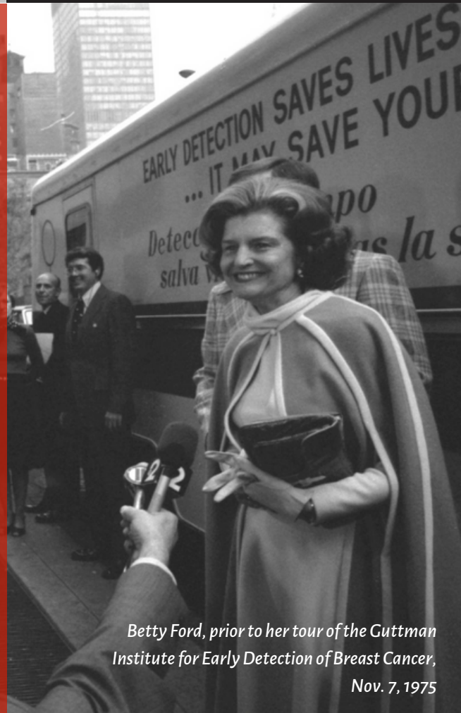
Betty Ford, prior to her tour of the Guttman Institute for Early Detection of Breast Cancer, Nov. 7, 1975