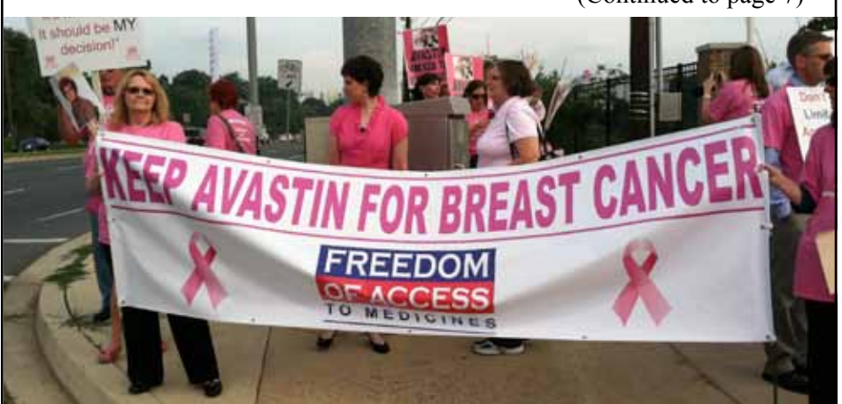
Protesters outside the FDA White Oak campus, June 28, before the Avastin hearing.